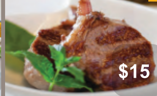
14. Herb infused Grilled French Lamb Cutlets Cooked Medium w Cashew Pesto (2)