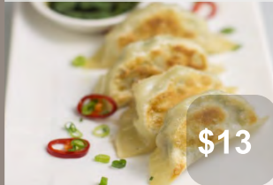
16. House made Pork Dumplings, Chives, Ginger, Garlic w Chilli Soy (4)