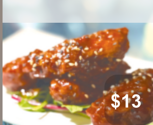
11. Korean Red Wings