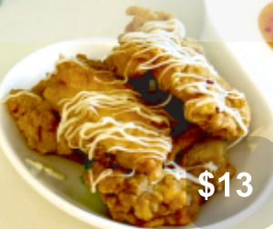
2. Chicken Karaage