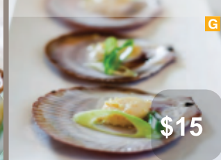
5. Grilled 1/2 Shell Local Scallops w Ginger & Shallots(3)