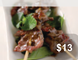
7. Wagyu Beef Skewers w Red Wine Pepper Sauce (2)