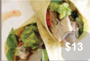
26. Tapas Tortillas w Meat, Lettuce, Cheese, Guacamole, Sweet Chilli, Sour Cream(2)