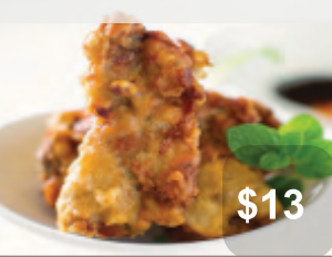
22. Boneless Spicy Battered Pork Ribs w Smoked BBQ