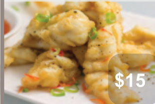
8. Battered or Grilled Salt & Pepper Squid w Aioli & Sweet Chilli Sauce