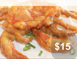
27. Tapas Battered Soft Shell Crab w Chilli Lime Sauce