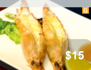
17. Grilled Local King Prawns w Garlic Butter (2)