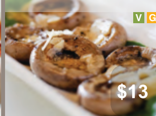
4. Grilled Button Mushrooms w Cheese & Pepper (6)