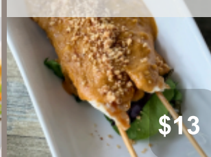
9. Satay Chicken Skewers w Peanut Satay Sauce (2)