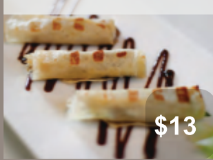
21. Peking Duck Crêpes w Pickles & Hoisin Sauce(3)