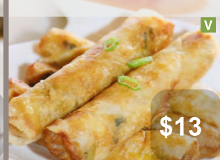
15. House made Vegetarian Spring Rolls (5)