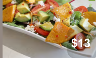
13. Henrik's Salad Mixed Lettuce, Avocado, Carrot, Onion, Pumpkin w Thai Style Dressing