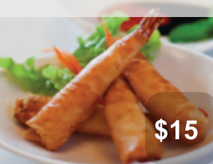
12. King Prawn Bacon Rolls w Chilli Soy (3)