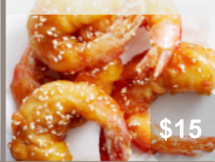
23. Honey King Prawns w Sesame Seeds (4)