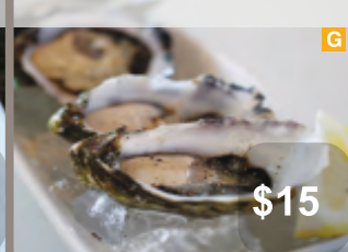
10. Australia Oysters Natural w Thai Style Sauce (3)