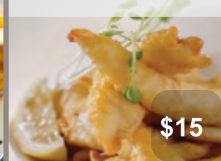
20. Battered Wild Barramundi Bites w Tartare Sauce (4)