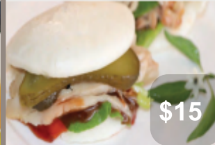
18. Henrik's Best Pork Belly Buns w Pickles, Coriander & Chinese BBQ Sauce (2)