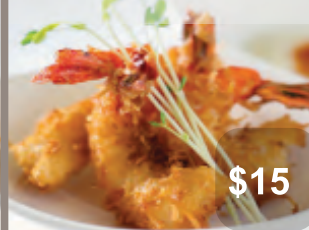
3. Coconut King Prawns w Aioli & Sweet Chilli Sauce (3)