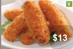
1. Sweet Potato Croquettes w Aioli & Sweet Chilli Sauce (5)