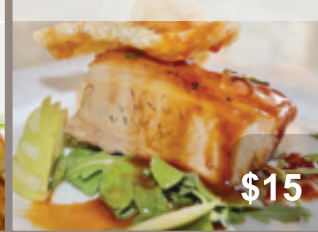
25. Slow Cooked Pork Belly w Pork Stew Sauce