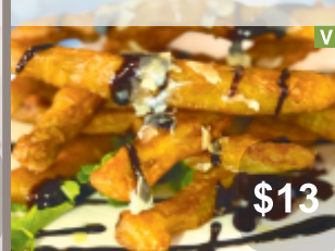
19. Crispy Eggplant Chips w Balsamic Glaze(6)